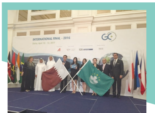
◀ 澳科大學生勇奪「2016 年度世界管理挑戰賽——多哈國際總決賽」全球總冠軍 M.U.S.T. Students Won World Champion at the "2016 Global Management Challenge - Doha International Finals".

► 2017 年，商學院的會計碩士學位課程再獲全球主要會計職業機構 ACCA (特許公認會計師公會) 的五年認證。會計碩士畢業生將獲得最高層次的豁免條件，可豁免全部九門科目並直接參加 ACCA 的資格考試。 The Master of Science in Accounting program of School of Business (MSB) has been accredited again by the Association of Chartered Certified Accountants (ACCA), a leading global body for professional accountants based in the UK, for a 5-year term from 2017. The ACCA accreditation allows the graduates studied Master of Science in Accounting for a full range of exemption, the maximum of nine papers, for sitting ACCA qualification examination.