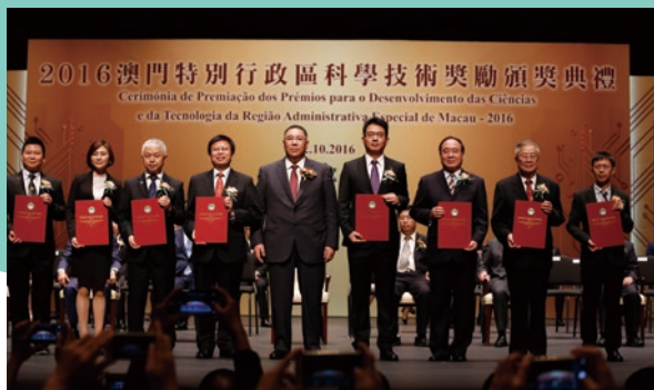
▲ 澳門科技大學研究團隊於 2016 年澳門特別行政區科學技術獎勵中，囊括了該次評獎中僅有的 2 個自然科學獎一等獎。 The research teams of MUST claimed the only two first prizes of Natural Sciences Awards of the 2016 Macao Science and Technology Awards.

大學於 2016 年澳門特別行政區科學技術獎勵中，共有 8 個項目獲獎，特別是囊括了該次評獎中僅有的 2 個一等獎。並於同年舉辦澳門高校首創之研究成果轉讓洽談會，回饋市民造福社會。