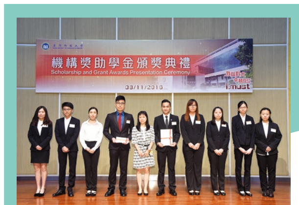
▲ 除入學獎助學金外，優秀學生亦有機會獲頒機構獎助學金 In addition to admission scholarships, outstanding students also have chance to be granted scholarships and grants from other Macau institutions.

Applicants with outstanding achievement in academic or professional fields will have the opportunity to receive full or half scholarships from the Macau University of Science and Technology Foundation. In addition, outstanding students also have the chance to be granted scholarships and grants from other Macau institutions.