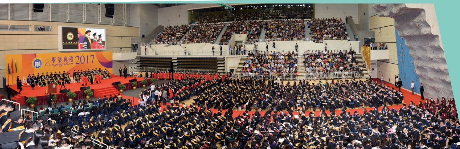
▼ 2017 年畢業典禮盛況 Grand occasion of the Congregation 2017

The University offers a wide range of specialized programs such as Business Analytics, Earth and Planetary Sciences, and Film Management etc.