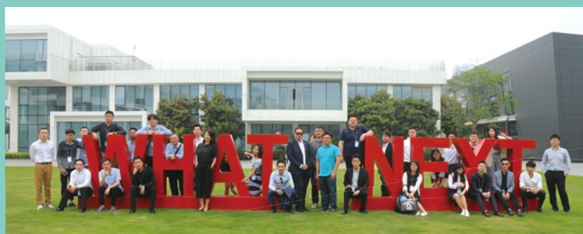
◀ 資訊科技學院師生參加校外考察團 Teachers and students from Faculty of Information Technology enjoyed the site visit activities.