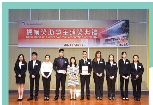
▲ 除入學獎助學金外，優秀學生亦有機會獲頒機構獎助學金 In addition to admission scholarships, outstanding students also have chance to be granted scholarships and grants from other Macau institutions.

Applicants with outstanding achievement in academic or professional fields will have the opportunity to receive full or half scholarships from the Macau University of Science and Technology Foundation. In addition, outstanding students also have the chance to be granted scholarships and grants from other Macau institutions.