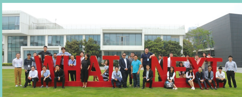
◀ 資訊科技學院師生參加校外考察團 Teachers and students from Faculty of Information Technology enjoyed the site visit activities.