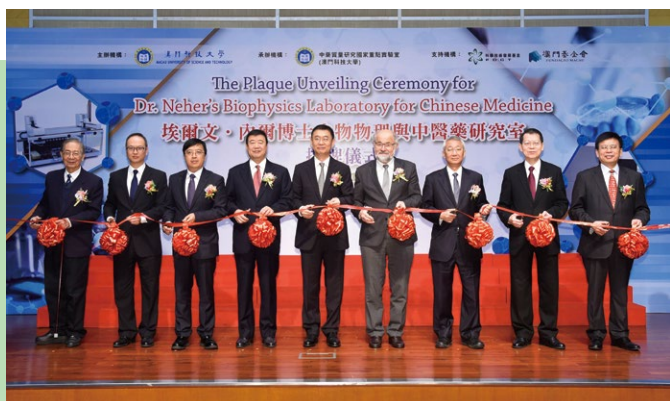
▲ 諾貝爾獎得主埃爾文·內爾博士（左六）生物物理與中醫藥研究室揭牌 Nobel Laureate Dr. Erwin Neher (left 6 th ) set up Biophysics Laboratory of Chinese Medicine at M.U.S.T.