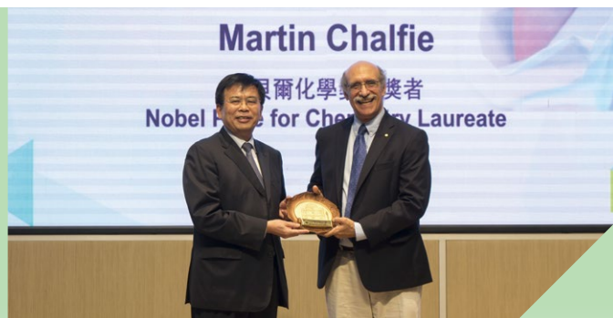
▲ 諾貝爾獎得主馬丁·查爾菲教授前來學院做生物醫學研究專題報告 Nobel Laureate Prof. Martin Chalfie gives an inspiring talk in M.U.S.T.