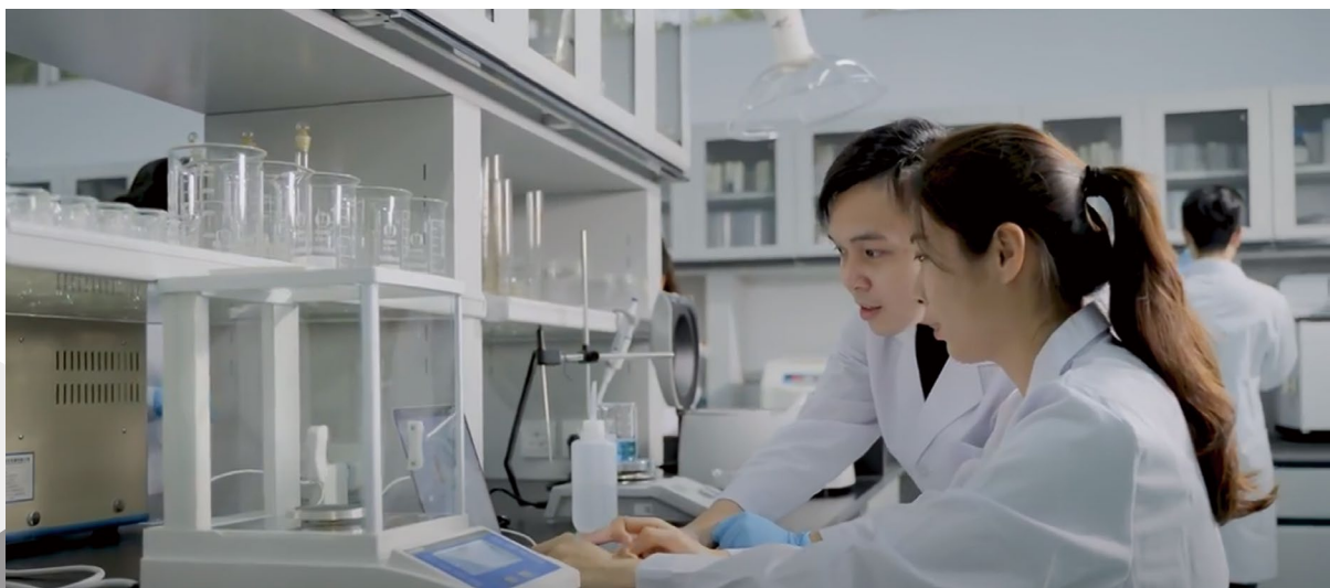
▲ Environmental Sciences Laboratory 環境科學實驗室