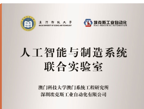
▲ Macao Institute of Systems Engineering and IKAS Industry set up the Collaborative Laboratory of Intelligent and Manufacturing Systems in 2020 2020 年澳門系統工程研究所與埃克斯（工業）成立人工智能與製造系統聯合實驗室

成立創新工程學院是在大學領導層深思熟慮，與持份者充分磋商，對全球大學和研究機構類似舉措認真研究，以及參考了來自科技界翹楚的積極反饋而做出的重大決定。澳門科技大學創新工程學院於 2022 年 3 月 27 日正式成立。