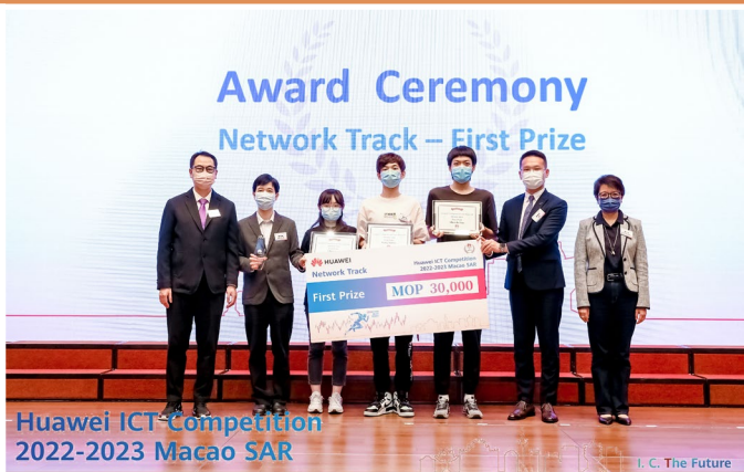
▲ Students won the First Prize of Network Track in Huawei ICT Competition 學生獲得華為 ICT 大賽網絡賽道第一名

澳門科技大學的五年策略規劃（2021- 2025 年）為大學的發展目標和重點發展方向制定了宏偉的藍圖。在重點發展方向中特別提出進一步加強工程學科建設以及鞏固優勢學科發展。我們生活在一個創新和技術高速發展的時代。在如此充滿挑戰的年代，為了成功培養未來的科技人才和領導者，重新調整學術和教育的目標，鞏固多學科、跨學科研發和教育的基石，已經成為全球教育工作者達成的共識。為適應時代的發展和社會的需求，大學 創新工程學院 (FIE) 由此而生。