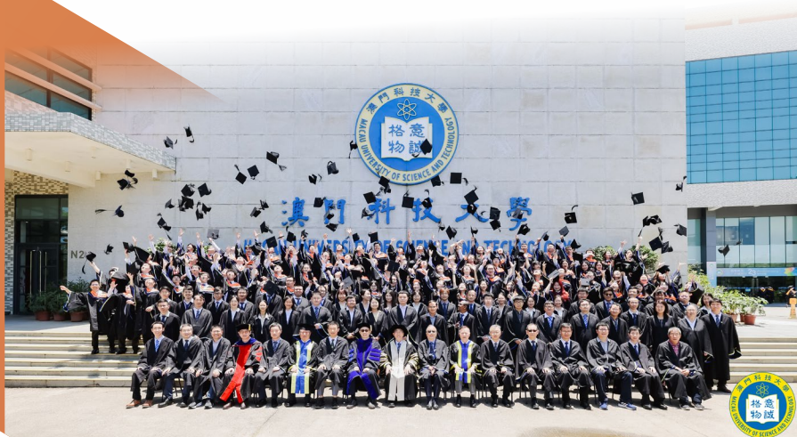
▲ 2022/2023 Faculty Graduation Ceremony Group Photo 2022/2023 學年學院畢業典禮合照

We live in a time when innovation and technological development take place at an increasingly fast pace. To prepare and cultivate future engineering talents and leaders who can succeed and thrive in such a challenging time, educators worldwide have come to the consensus that the academic approach to engineering disciplines and interdisciplinary collaborations is in need of a fundamental rethinking and strategizing. This is what inspires the University to undertake the initiative of creating Faculty of Innovation Engineering (FIE) .