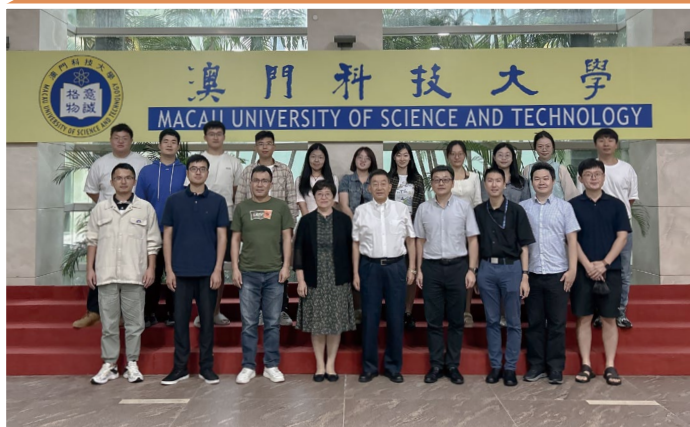
▲ Group photo of the orientation meeting for 2023 doctoral students in the Department of Materials Science and Engineering 材料科學與工程系 2023 年級博士新生迎新會合照