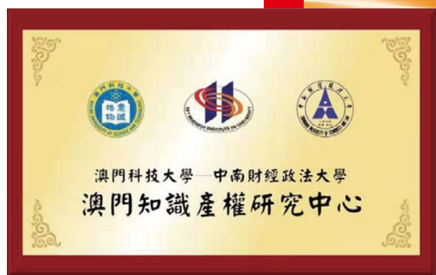
▲ 澳門知識產權研究中心 Macao Intellectual Property Research Center