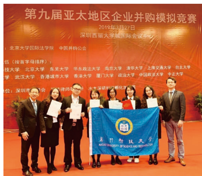
▲ 第九屆「亞太地區企業併購模擬競賽」獲獎 The 9 th Asia-Pacific M&A Moot Competition

The Faculty focuses on the academic investigations of the comparative law and cross-