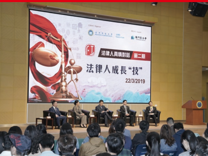
▲ 法律人真情對話：法律人成長“技” Dialogue with Jurists: Essential skills for Jurists