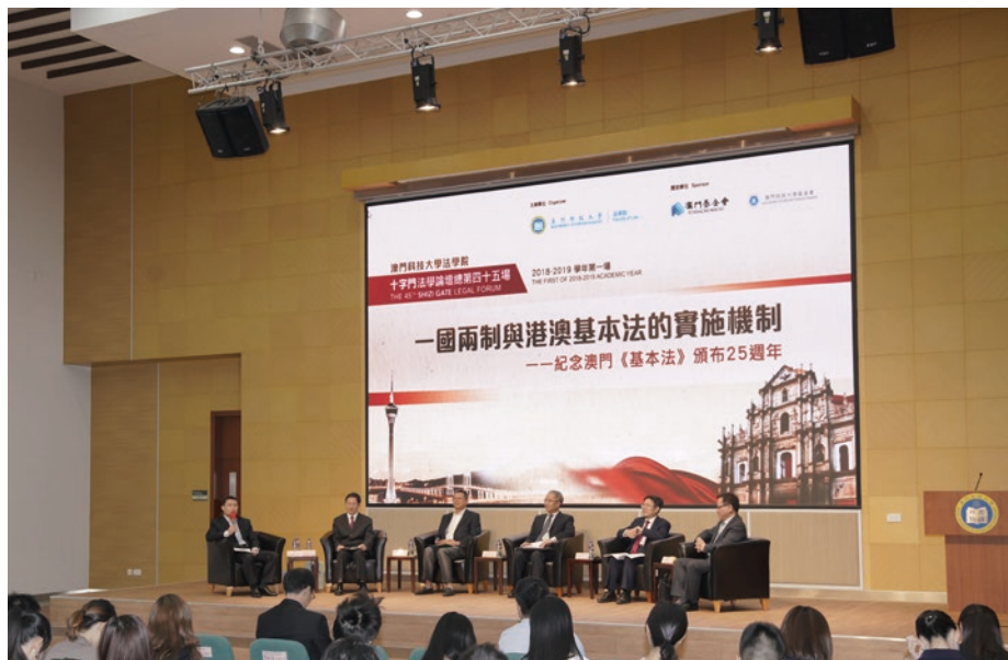
▲ 十字門法學論壇 The Shizi Gate Legal Forum

The postgraduate programs at the MUST Faculty of Law aims at developing the high-end legal professionals with the ideal of the rule of law, the global vision, the solid foundation of law discipline and the capacity of cross-jurisdictional research and work, through the strengthening of the students' knowledge, theory and application skills. Correspondingly, the components of the programs include the teaching of courses, academic lectures, study reports, internship and dissertations. The Faculty of Law offers six postgraduate programs leading to the degrees of Master of Laws, Juris Master, Master of Criminal