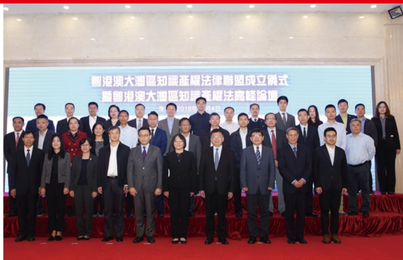
▲ 粵港澳大灣區知識產權法律聯盟成立 The Launch Ceremony for Intellectual Property Law Alliance of Guangdong-Hong Kong-Macao Greater Bay Area