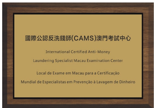
▲ 國際公認反洗錢師 (CAMS) 澳門考試中心 International Certified Anti-Money Laundering Specialist Macau Examination Center

學院側重比較法和跨域法律領域的學術研究，廣邀海峽兩岸暨港澳乃至世界各地學者，搭建跨域法律研究平臺。學院定期舉辦各種學術活動，如「十字門名家講壇」、「十字門法學論壇」等，邀請澳門內外知名法學家和業界人士，就重大法學學術和法律實踐問題發表演講，推動法律基礎理論研究及跨學科研究，為學院凝聚良好的地區學術影響力。