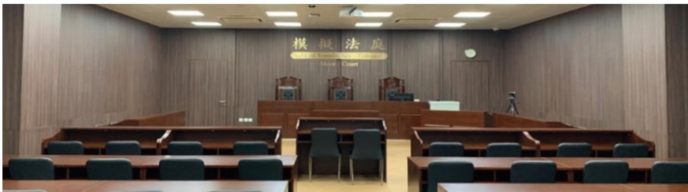
▲ 模擬法庭 Moot Court

Established in March 2000, the Faculty of Law was one of the first four faculties when the Macau University of Science and Technology was founded. With the historical context of multiculturalism and the tendency toward cross-border law development, after years' growth, the Faculty has gradually formed a teaching and research tradition characterized as multicultural environment and cross-border law, and set its mission and vision: Cultivate Local and Cross-border Legal Talents within the context of Multiculturalism and Internationalism in its Macao and Cross-Straits Four-Regions Base, and to promote the rule of law.