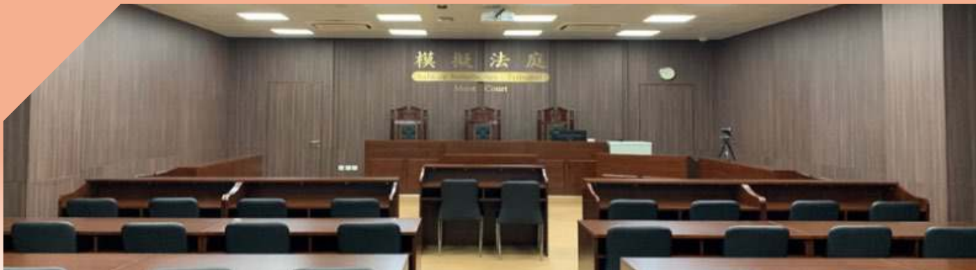
▲ 模擬法庭 Moot Court

Established in March 2000, the Faculty of Law was one of the first four faculties when the Macau University of Science and Technology was founded. With the historical context of multiculturalism and the tendency toward cross-border law development, after years' growth, the Faculty has gradually formed a teaching and research tradition characterized as multicultural environment and cross-border law, and set its mission and vision: Cultivate Local and Cross-border Legal Talents within the context of Multiculturalism and Internationalism in its Macao and Cross-Straits Four-Regions Base, and to promote the rule of law.