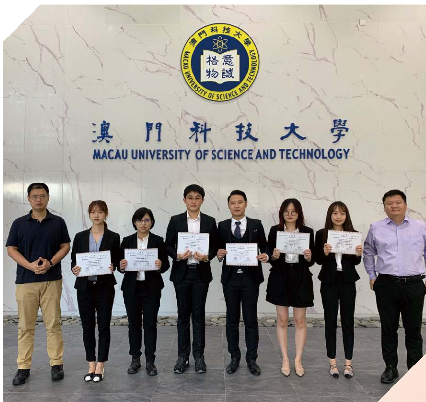
▲ 奪冠「2020 國際刑事法院中文模擬法庭比賽」2020 ICC Moot Court Competition

「法律實踐教學中心」於 2016 年 11 月成立。作為法學院開展實踐教學、專題研究及提供社會服務的平臺，中心著力培養學生的法律實踐技能，拓展法學院與業界之交流與合作，參與推動法學教育發展和法治社會建設。中心選任法學院具法律實踐經驗的全職教師擔任實踐教學導師，邀請境內外法律界知名人士擔任高級顧問，聘請資深專業人士擔任高級導師，為學生展開更貼近實務的實踐教學活動，以加強法學院學生專業理論學習與法律實務操作的有機結合。中心的成立得到境內外法律機構的大力支持，現已與多家律師事務所、司法機關等簽署各類合作協議。協議單位作為法學院學生的實習基地，將與中心一起合作開展課題研究及共同舉辦學術活動，以法律實踐教學為中心，在多元領域展開廣泛合作。中心為學生開設案例研習科目、承接專題項目研究、舉辦法律實踐講座、組織法律理論及實務培訓、參加專業類學生競賽等，並通過實踐教學的形式，為校內外機構、政府部門提供專業諮詢服務。