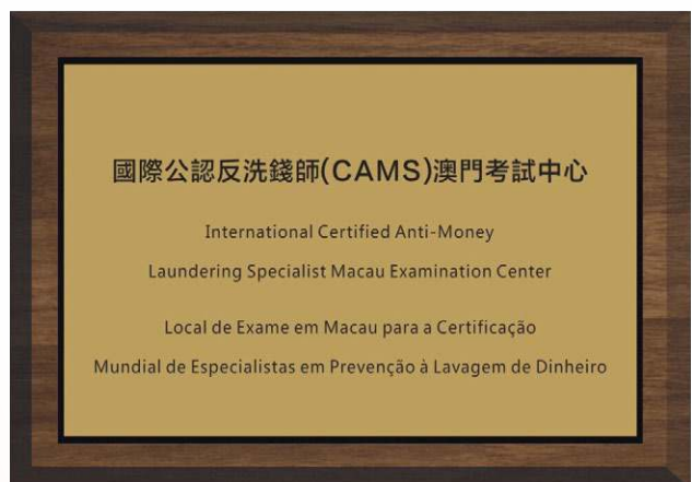
▲ 國際公認反洗錢師 (CAMS) 澳門考試中心 International Certified Anti-Money Laundering Specialist Macau Examination Center

學院側重比較法和跨域法律領域的學術研究，廣邀海峽兩岸暨港澳乃至世界各地學者，搭建跨域法律研究平臺。學院定期舉辦各種學術活動，如「十字門名家講壇」、「十字門法學論壇」等，邀請澳門內外知名法學家和業界人士，就重大法學學術和法律實踐問題發表演講，推動法律基礎理論研究及跨學科研究，為學院凝聚良好的地區學術影響力。