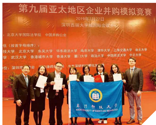
▲ 第九届「亞太地區企業併購模擬競賽」獲獎 The 9 th Asia-Pacific M&A Moot Competition

The Faculty focuses on the academic investigations of the comparative law and cross-border legal areas, widely welcomes the scholars