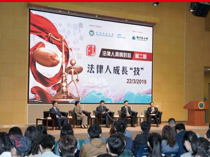
▲ 法律人真情對話：法律人成長“技” Dialogue with Jurists: Essential skills for Jurists