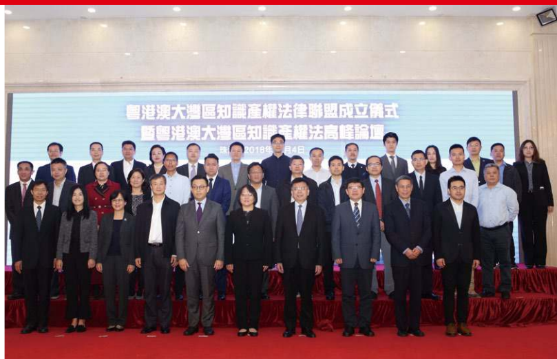
▲ 粵港澳大灣區知識產權法律聯盟成立 The Launch Ceremony for Intellectual Property Law Alliance of Guangdong-Hong Kong-Macao Greater Bay Area