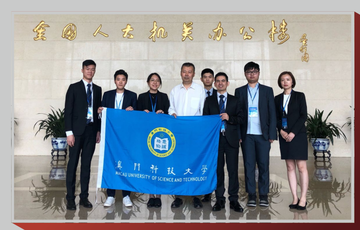
▲ 暑期實習活動 - 法學院學生拜訪全國人大常委會港澳基本法委員會 Summer internship activities -FL Students visited Hong Kong and Macao Basic Law Committee of the Standing Committee of the National People's Congress

Established in March 2000, the Faculty of Law was one of the first four faculties when the Macau University of Science and Technology was founded. With the historical context of multiculturalism and the tendency toward cross-border law development, after years' growth, the Faculty has gradually formed a teaching and research tradition characterized as multicultural environment and cross-border law, and set its mission and vision: Cultivate Local and Cross-border Legal Talents within the context of Multiculturalism and Internationalism in its Macao and Cross-Straits Four-Regions Base, and to promote the rule of law.