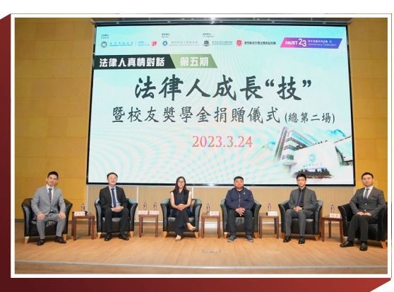
▲ 法律人真情對話:法律人成長"技" Legal Experts Sincere Talk