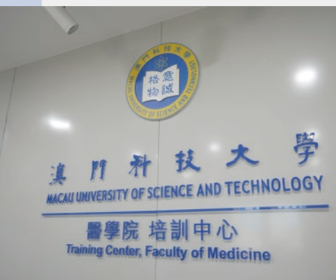
▲ 醫學院培訓中心下設專業醫療發展中心和醫療及衛生持續培訓中心 The Faculty of Medicine Training Center, housing the Centers of Excellence for Professional Medical Development, for Continuing Medical Education and for Education in Medical Simulation.

These Centers house state-of-the-art virtual reality manikin-based system and innovative software tools. They include: 3D anatomy system, robotic surgery simulator, endovascular simulator, neurosurgical simulator, high-fidelity ultrasound simulator (one common platform with cardiac, lung, abdominal and obstetrics & gynaecology functions), portable ultrasound machine, 3D spinal surgery simulator, joint arthroscopy simulator, laparoscopic and endoscopic surgical simulator, etc. The scope of study covers Critical Care Medicine, Cardiology, Cardiothoracic Surgery, Neurosurgery, Obstetrics and Gynecology, Pediatrics, Radiology, Gastroenterology, Orthopedics, Urology, General surgery and Anatomy. As a result, we have successfully established a learning platform for clinical practice skills, and through a series of medical academic courses, we provide high quality healthcare simulation training in Macao. These facilitate local medical staff to practice modern skills under a controlled and safe environment, and will therefore promote the highest standards of excellence and professionalism and enable patients to receive better medical services.