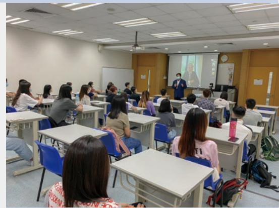
▲ 社交距離下進行面授課堂交流。 Socially distanced face-to-face delivery of our curriculum.

The Faculty has established the Center for