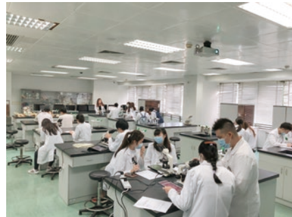
▼ 一年級醫科學生在進行組織學實驗課。 Our Year 1 MBBS students in a histology practical session.

每年醫學院會以學術主持的身份舉辦「中葡國際醫學論壇」，通過專題研討會，充分發揮澳門與葡語國家的聯繫優勢，促進澳門作為中國與世界匯聚地的作用。論壇邀請了來自美國、英國、澳洲、法國、瑞典、義大利、葡萄牙、中國內地及港澳台等世界各地的優秀學者及醫學專家出席，在過去的八年裏，參與論壇活動的澳門的醫生和護士超過 7000 名。