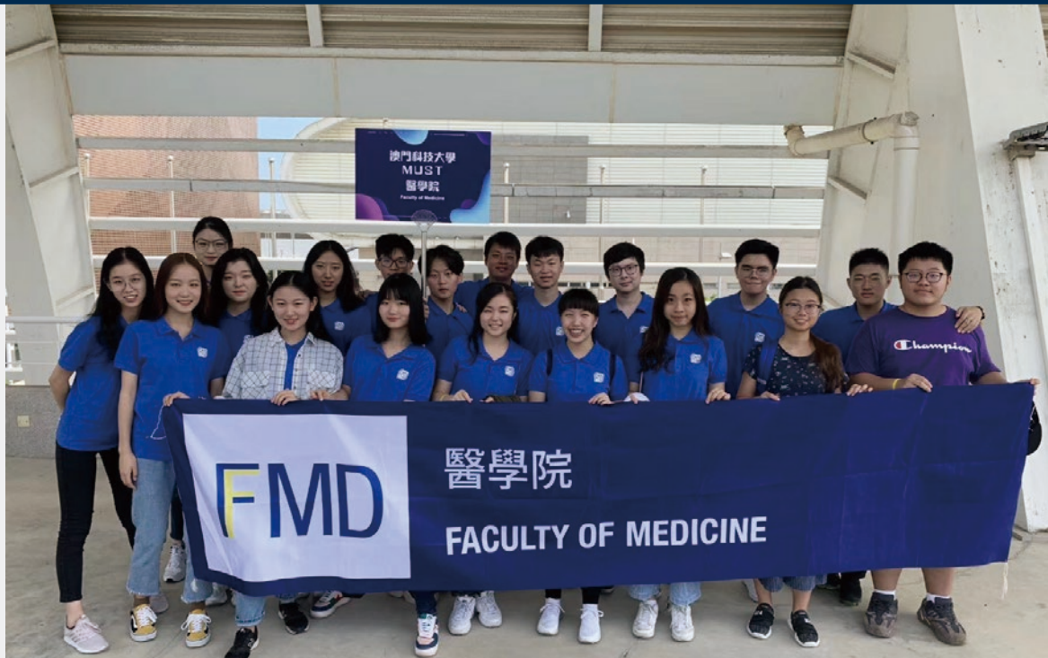
▲ 醫學院學生代表參加了「慶祝澳門回歸 20 周年暨澳門科技大學建校 20 周年第七屆運動會」

We benchmark our MBBS students to international standards by partnering with Harvard Medical School and subscribe to their online teaching and assessment tool, HMX, to run alongside our MBBS curriculum. The HMX Fundamentals modules cover foundational topics in physiology, genetics, biochemistry, pharmacology and immunology. Our Years 1 & 2 MBBS students are enrolled onto these modules, and take part in a scheduled exam on each component. The majority of our first cohort of students obtained the Achievement award, scoring over 80% in the module. They were awarded a Certificate Achievement from Harvard Medical School.