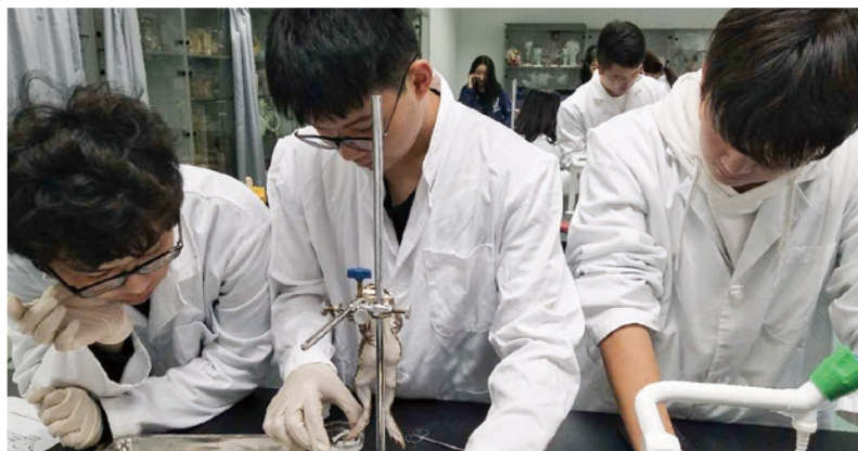
▲ 同學們在生理學實驗課以小組形式進行反射弧測試。 Students are conducting a test for reflexes during the physiology practical class.