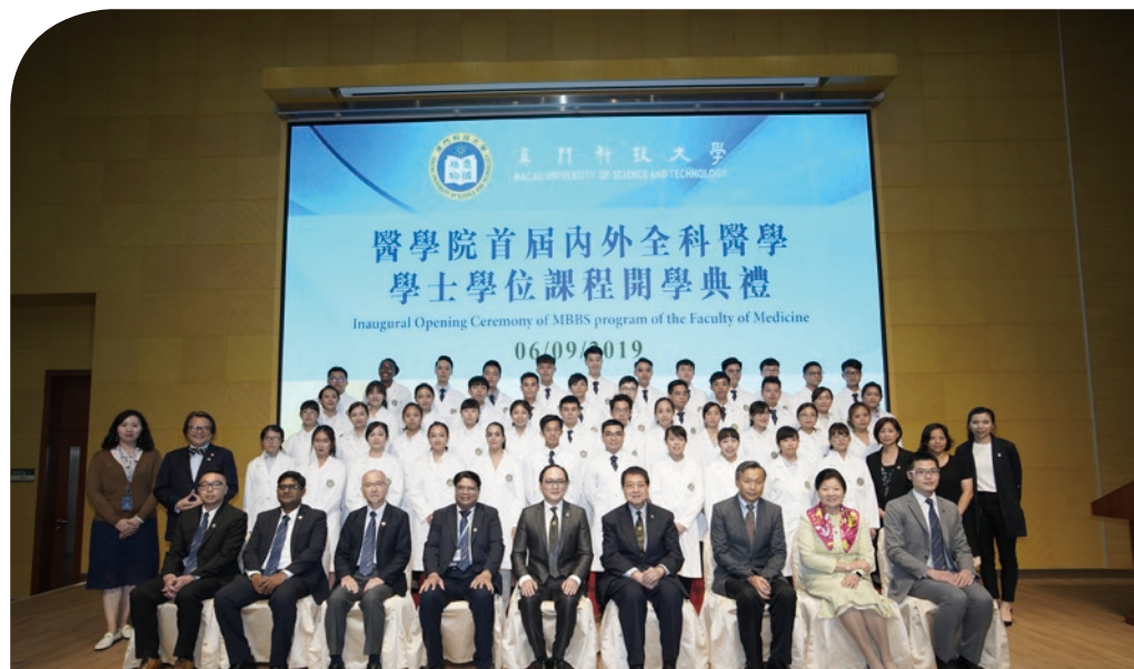
▲ 首屆內外全科醫學學士學位課程開學典禮 Inauguration ceremony of our MBBS programme.

理論和實踐技能，掌握食品生產、質量控制、科學研究、食品貿易與管理、公共營養與臨床營養和新食品研發的專業知識、技術和技能的食品與營養科學專門人才。