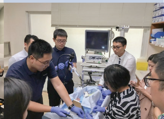
▲ 採用模擬技術作專業進修訓練 Postgraduate training using simulation technology