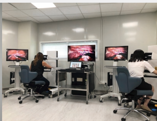
▲ 醫學模擬教育中心配置先進的多學科培訓器材，致力為醫護人員提供認可的持續醫學教育課程。 Our Center for Education in Medical Simulation is a state-of-the-art multidisciplinary training facility, for medical professionals and healthcare leaders in alignment with recognized Continuing Medical Education curricula.