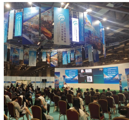
▲ 學院協辦大學學術研討會

There is a wide range of employment opportunities for graduates who study this program. There has always been a shortage of professionals in the service industry in Macau. With the arrival of more and more famous international brands in Macau, the demand for management talents in international enterprises is gradually becoming stronger, graduates will have a good career prospect. Students can work in leisure, exhibition, tourism, hospitality, entertainment, catering and other service industries.