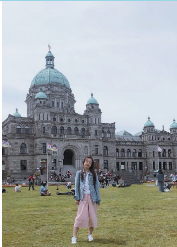
▲ 英屬哥倫比亞大學暑期項目 Summer Program in the University of British Columbia, Canada

Our graduates have impressive destinations after they finish their studies. Over half of graduates from the baccalaureate degree program have continued to pursue post-graduate studies (areas of study arranging from Creative Media, Public Policies, International Trades, Tourism Management in Natural/Cultural Resources, Communication & Commercial Analyses, Social Science, English, Education, Nursing, Engineering Management) in institutions of higher education (UK, Canada, USA, Australia, France, Portugal, Spain, Switzerland, Singapore, Hong Kong/China). The destination results indicate added value to our students in their pursue of post-graduate studies at both master's and doctoral levels. For the post-graduate students, the destination after their completion of the post-graduation programs includes serving as volunteer teachers of Chinese as a foreign language (approximately 10%) in some 11 countries and regions (Korea, Cambodia, Thailand, the Philippines, Spain, Portugal, France, Russia, Chile, Mozambique, Morocco, Serbia, and Macao) or seeking employment in institutions of higher education, enterprises and government in mainland China.