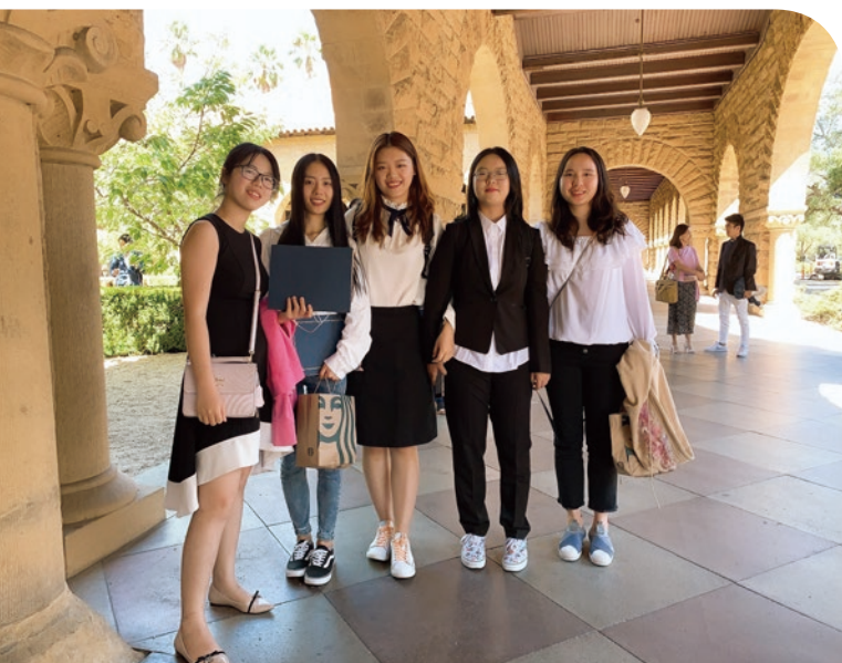
▲ 美國斯坦福大學 VIA 英語及美國文化課程

國際漢語教育研究生課程學生畢業去向追蹤統計顯示，每年通過國家漢辦孔子學院平台派往海外的人數約 10% 左右，所去國家涵蓋十餘個國家和地區（韓國、柬埔寨、泰國、菲律賓、西班牙、葡萄牙、法國、俄羅斯、智利、莫桑比克、摩洛哥、塞爾維亞、澳門），其他畢業生就業於內地高校、政府部門、企業等。