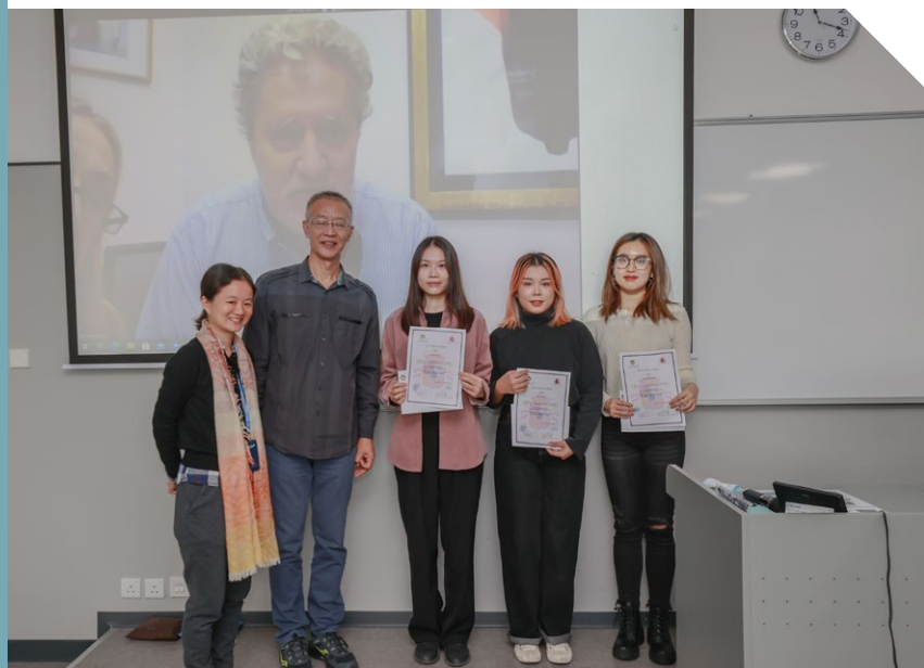
▲ 西班牙駐香港總領事館語言文化傳播獎獲獎同學 Awardees of the Consulate General of Spain Prize for the Promotion of Spanish Language and Culture

國際學院學生畢業去向跟蹤統計顯示，本科三個專業畢業生選擇並被錄取在英國、美國、澳大利亞、法國、瑞士、葡萄牙、西班牙、香港等國家或地區大學讀研佔畢業生 50% 之上，所學研究生專業跨度廣（創意媒體、公共政策、國際貿易、國際市場、自然和文化資源的旅遊管理、視聽傳播與廣告內容、社會科學、護理學、英語教育、教育管理、機械工程管理），就讀院校質素高（劍橋大學、倫敦政治經濟學院、倫敦國王學院、愛丁堡大學、格拉斯哥大學、拉夫堡大學、英屬哥倫比亞大學、紐約大學、波士頓大學、悉尼大學、墨爾本大學、昆士蘭大學、麥考瑞大學、馬蘭歐尼巴黎校區、蒙特酒店管理學院、巴塞羅那自治大學、巴塞羅那大學、康普斯頓大學、CEF 馬德里金融研究中心、卡斯蒂利亞拉曼卻大學、卡洛斯三世大學、龐培法布拉大學、香港大