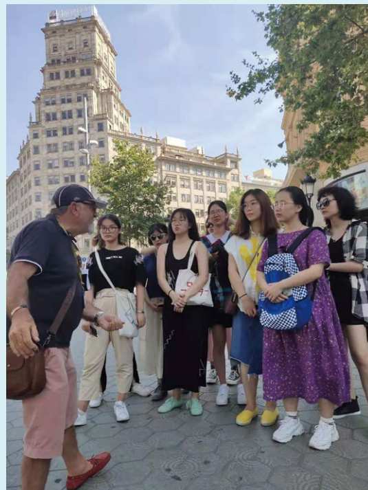
▲ 西班牙巴塞隆納自治大學暑期項目 Summer Program hosted by the Autonomous University of Barcelona, Spain