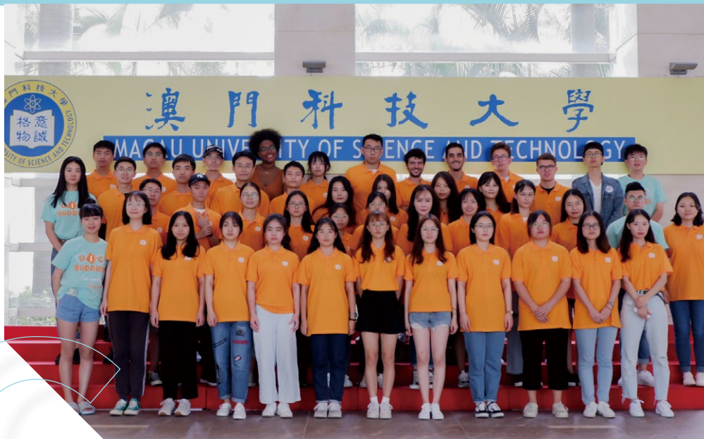
▲ 交換生及國際學院學生大使合照 Incoming exchange students and UIC buddies

國 際學院是一個集學歷教育與非學歷培訓於一體的教學單位，設有外國語學士（葡萄牙語、西班牙語、英語）、外國語碩士（葡萄牙語、西班牙語、英語）、國際漢語教育碩士、國際漢語教育博士和創意寫作博士課程。此外，學院為大學提供通識教育中、英文課程以及非學歷教育：DELE 考試備考線上課程。