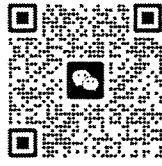
CCISTC 澳門辦事處聯絡 CCISTC Macau Contact