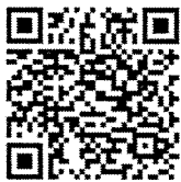
英語文化營資訊 Programme Info

https://www.ccistc.com/summer-research-programmes