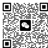
CCISTC 澳門辦事處聯絡 CCISTC Macau Contact