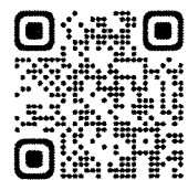
立即報名 Apply Now